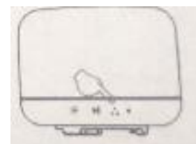
Indication of aroma diffuser button

Short press again: Scent for 180 minutes Keep short press to close.