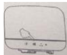
Indication button LED lighting

Turn on the search for Bluetooth devices "SHS1618", which can play music after matching. If you do not use it for a long time, you should let the water from the water mass of the tank run dry and then store it well. If you want to use it, use the neutral detergent to clean the water again, and then you can use it.